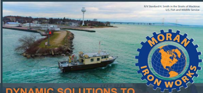
R/V Stanford H. Smith in the Straits of Mackinac