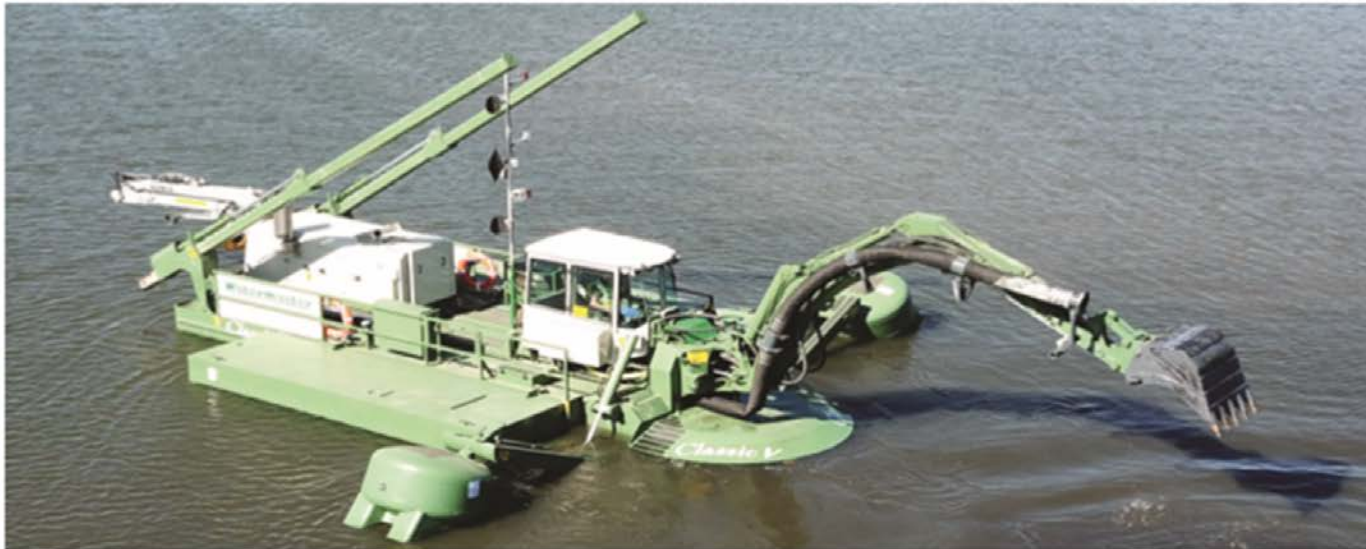
AMD 5000 Multi-Purpose Dredger